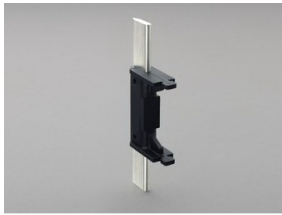
03 163 knife link 400 A size 2