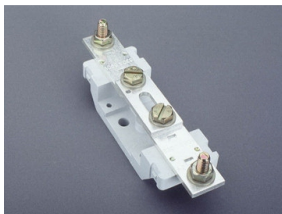
03 757 neutral conductor 400 A, disconnectable screw on both sides